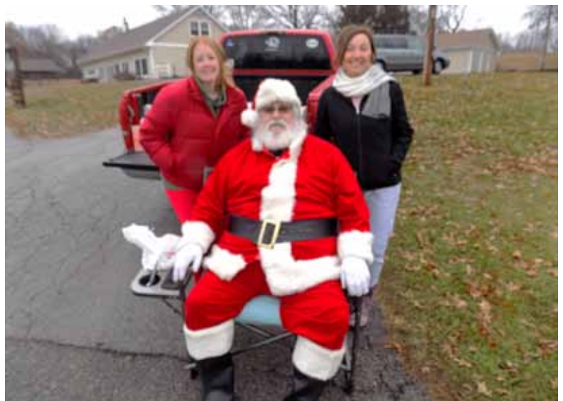
COLLECTING WITH RED ONE -- The Women's Club reported collecting $3,800 for Lake employees with Santa at the Gates.