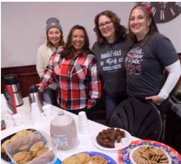
SERVING UP SNACKS -- at lighting of the first Lake Tapawingo Mayor's Christmas Tree.