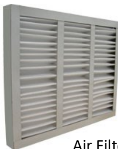
Air Filters by the case